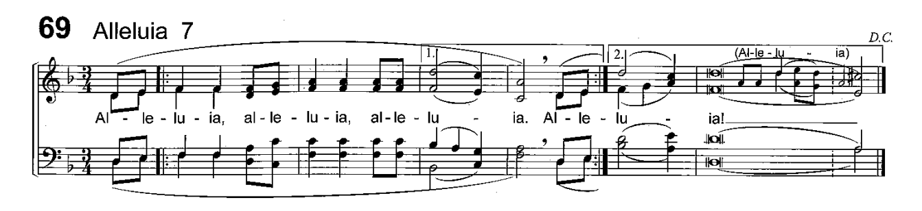
(Hum under psalm leader during each verse.)