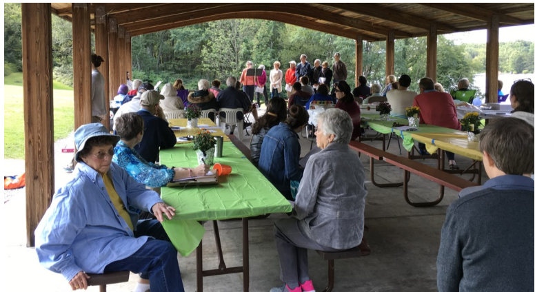
Everyone enjoyed a wonderful potluck picnic lunch after worship.