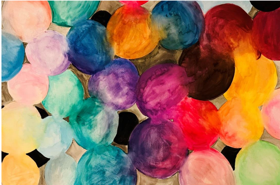
- Bulletin Artwork created by Amy Folkedahl